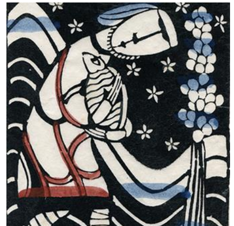
Good Shepherd by Sadao Watanabe

Help us to listen to and follow you Amen