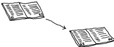
A PAGE HAS BEEN TURNED IN THE LECTIONARY