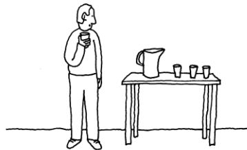
THE POST-SERVICE ORANGE SQUASH HAS BEEN MADE AT NORMAL DILUTION