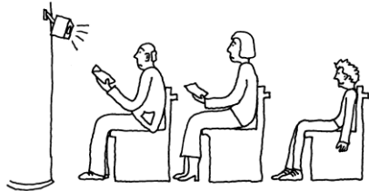
THE PA SYSTEM HAS BEEN TUNED TO AN UNFAMILIAR RADIO STATION