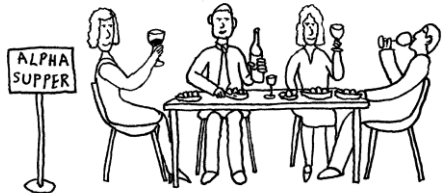
IT IS A SEASON OF ABSTINENCE AND FASTING