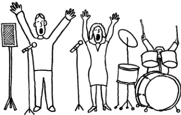
LENT IS A TIME FOR QUIET REFLECTION AND CONTEMPLATION