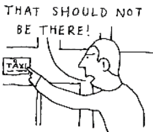
WRATH (DIRECTED AT INVALID ADDITIONS)