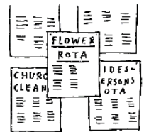
PRIDE (COVERING UP OTHERS' WORK)