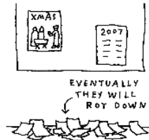
SLOTH (NOT REMOVING OLD NOTICES)