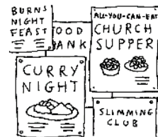
GLUTTONY (OVERINDULGENCE, ETC)