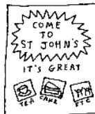
ENVY (RIVAL CHURCHES POACHING OUR CONGREGATION)